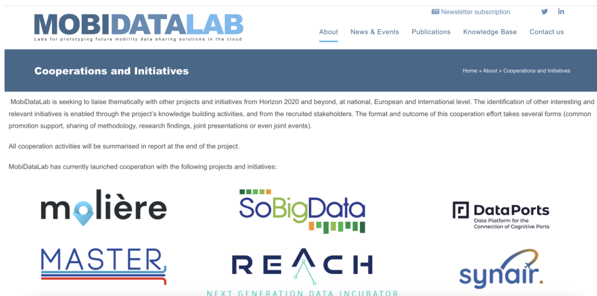
Figure 1. MobiDataLab Website Partnership Page

A Collaboration Log has been created, for regular monitoring and reporting on the progress of cooperation initiatives. Also, a partnership page on the project's website is made (see Figure 1), to showcase the collaborations established and the work jointly developed.